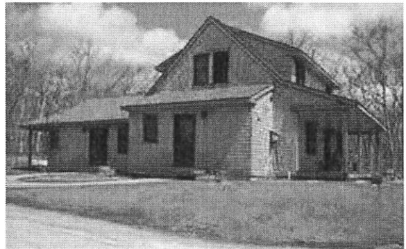
Middle Line Road Duplex

Rent your dwelling (house or guest-house) year-round. Affordable rentals can be subsidized by the Town.